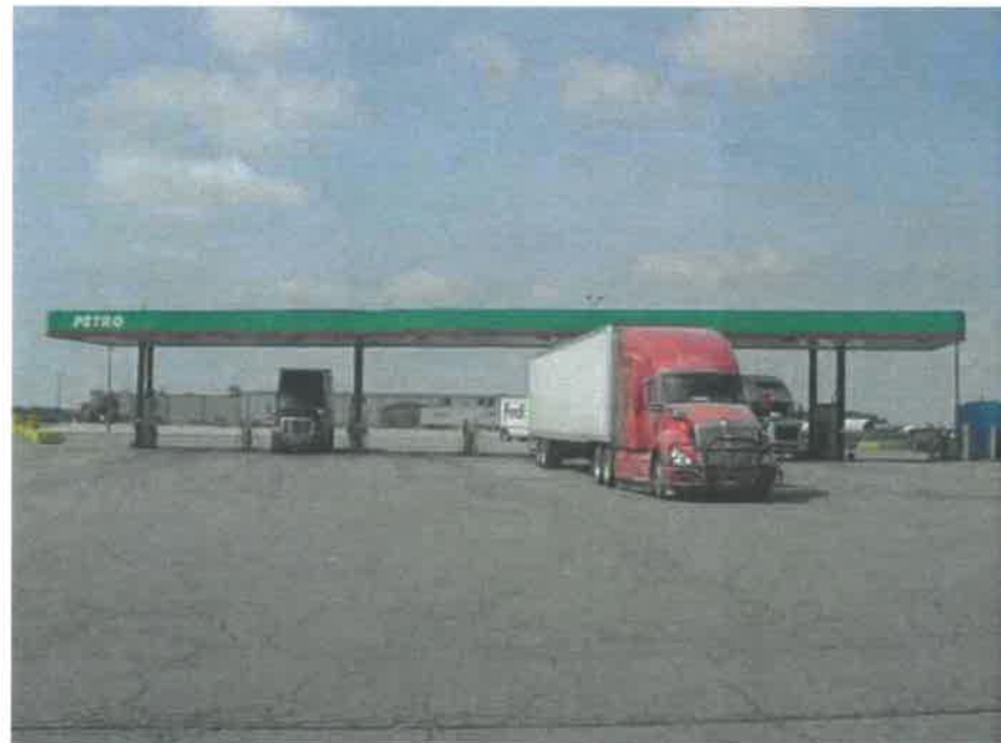
3 Rear Elevation