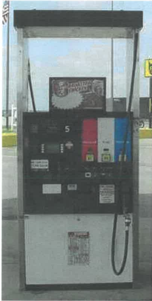
Gilbarco - Encore 300/500 (3+0) Qty = 3