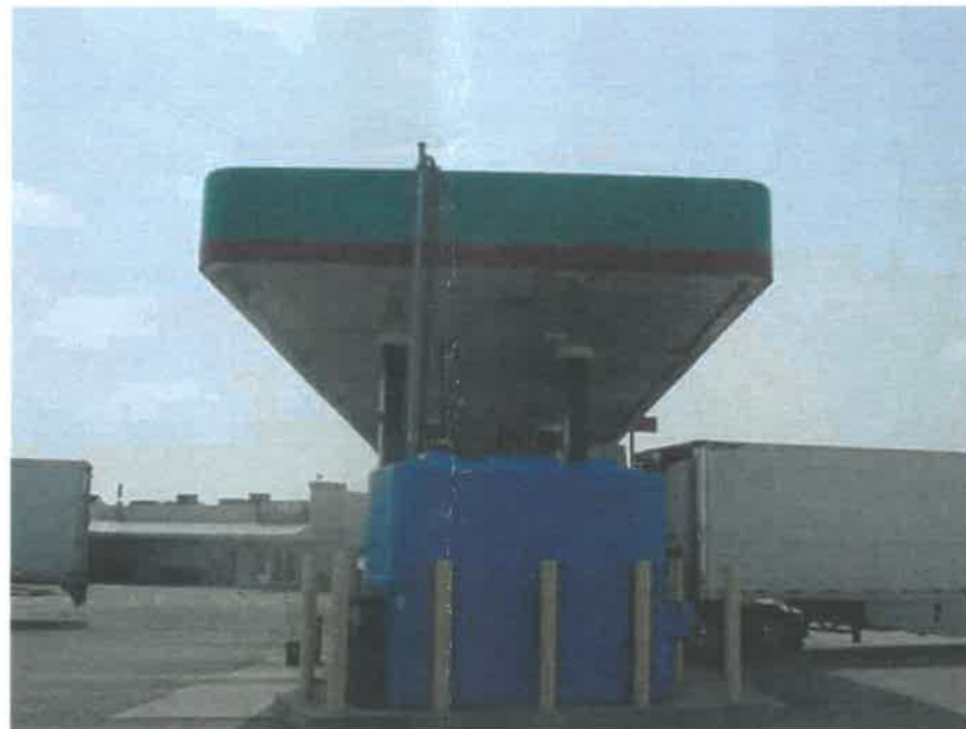
4 Right Elevation