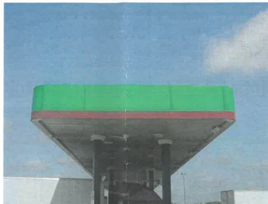
2 Left Elevation