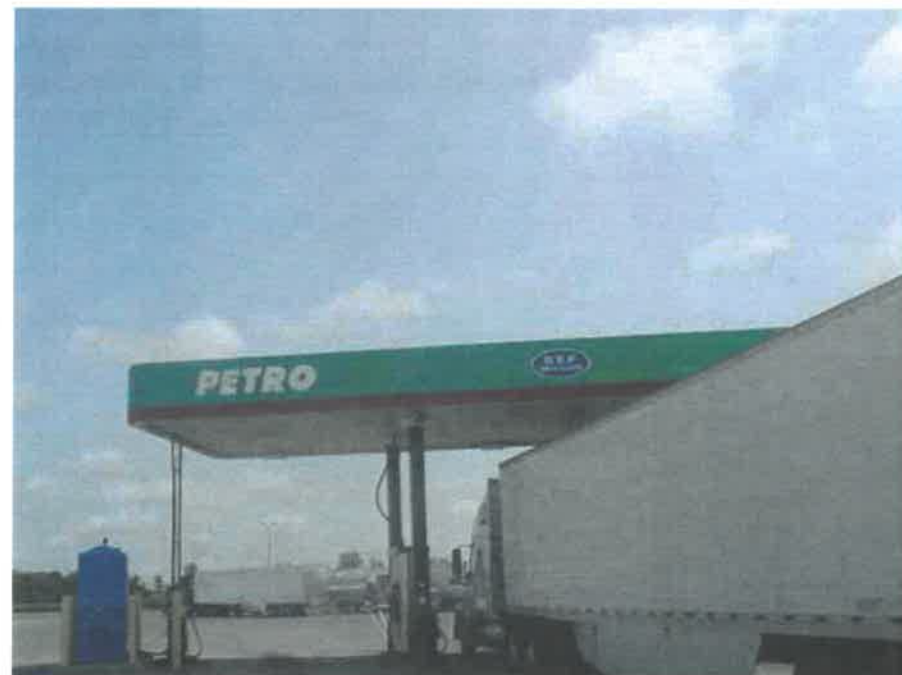
1 Front Elevation

Scope of Work: Diesel canopy is to remain as is.